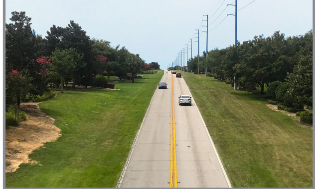
Old Lake Wilson Road Looking South